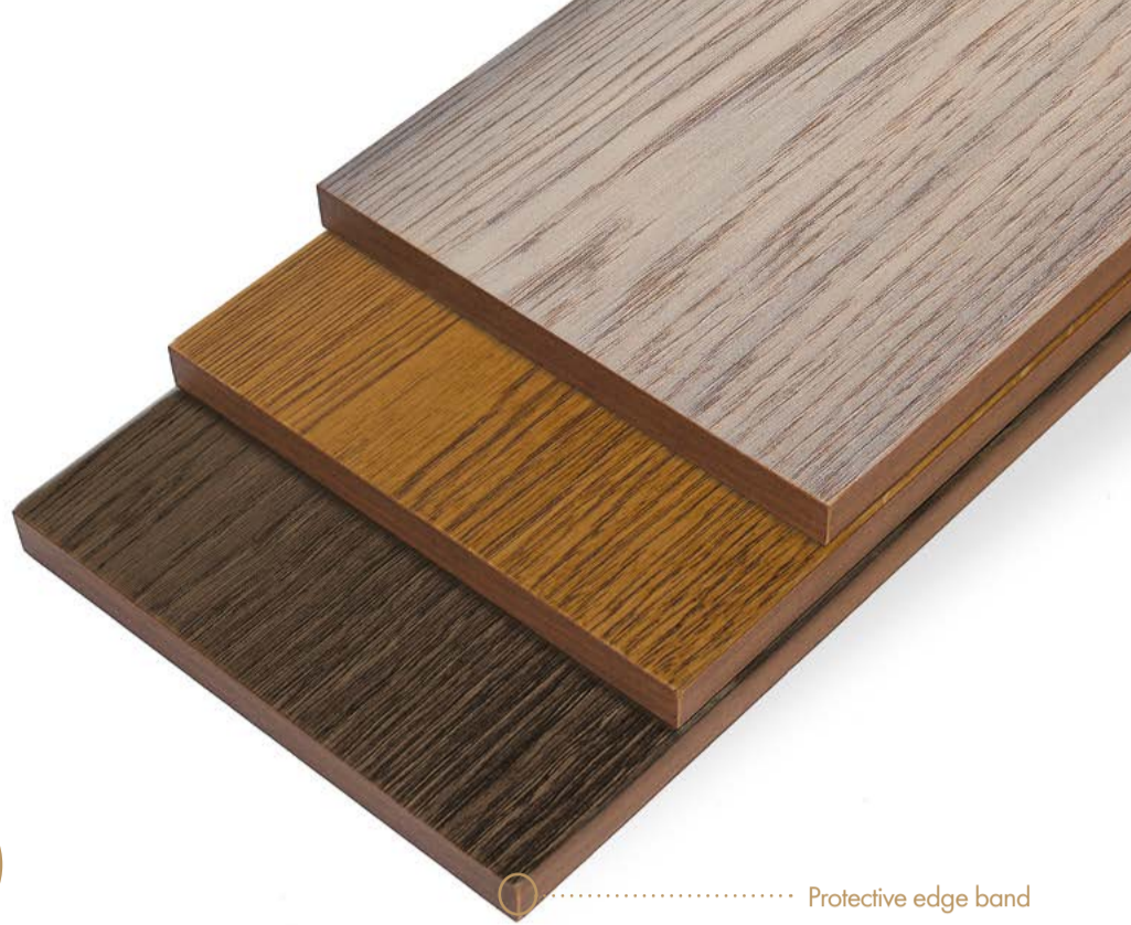
Protective edge band

The beauty of an Attiro floor isn't only in its looks, but in its elegant design. Because Attiro uses a magnetic base to secure to the steel encapsulated raised floor panels, it makes accessing underfloor voids effortless.